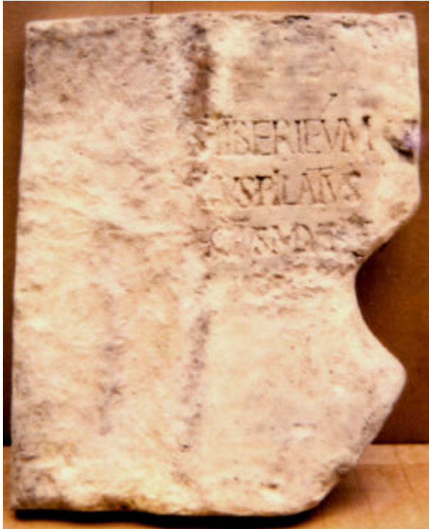
Pontius Pilate Cornerstone

Here you see documentation beginning with the First Century events. Thanks to scholars who revealed numerous archaeological discoveries and began to decipher the Dead Sea Scrolls we now have a clear picture of the world of the Middle East at the turn of the first Millennium. As historical evidence has become available, we have acquired copies of Caesar's census on papyrus, a copy of Pontius Pilate's cornerstone from Caesarea,